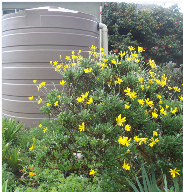
A well designed rainwater harvesting system, 865 gallon cistern in a residential backyard.

\text{SUPPLY (gallons)} = \text{INCHES OF RAINFALL} \times 0.623 \times \text{CATCHMENT AREA (sq ft of roof)} \times .90 (runoff coefficient for a metal or asphalt roof)